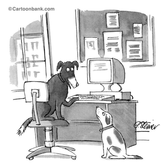
"On the Internet, nobody knows you're a dog."

Any research involving groups with limited capacity for informed consent (examples would be prisoners or the mentally impaired) must have prior IRB approval before any contact with subjects is undertaken. In all cases care should be taken to protect the confidentiality of respondents